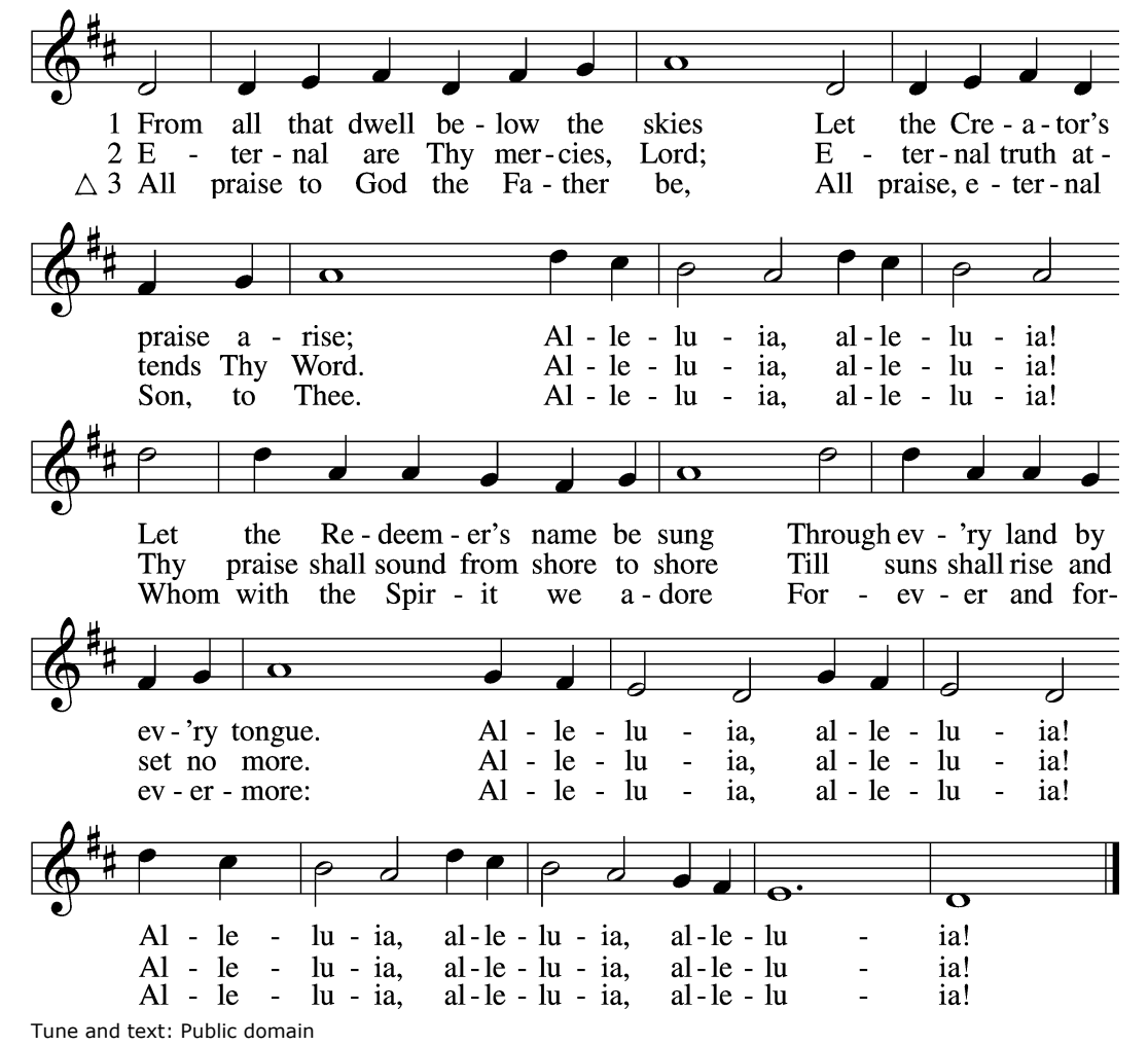
POSTLUDE - "In Christ There Is No East Or West" tune St. Peter; setting by Warriner

HYMN 816 From All That Dwell Below the Skies