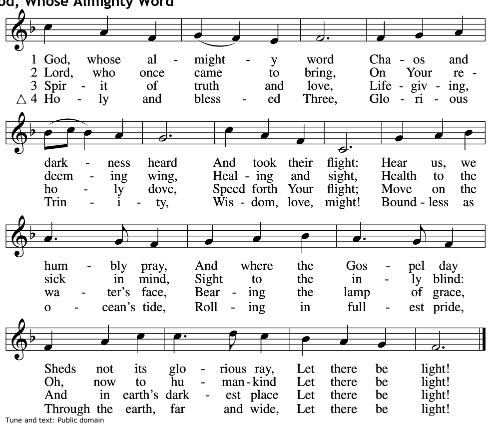
Postlude - "We Plow The Fields And Scatter" tune Wir Pflugen; arranged by Hughes