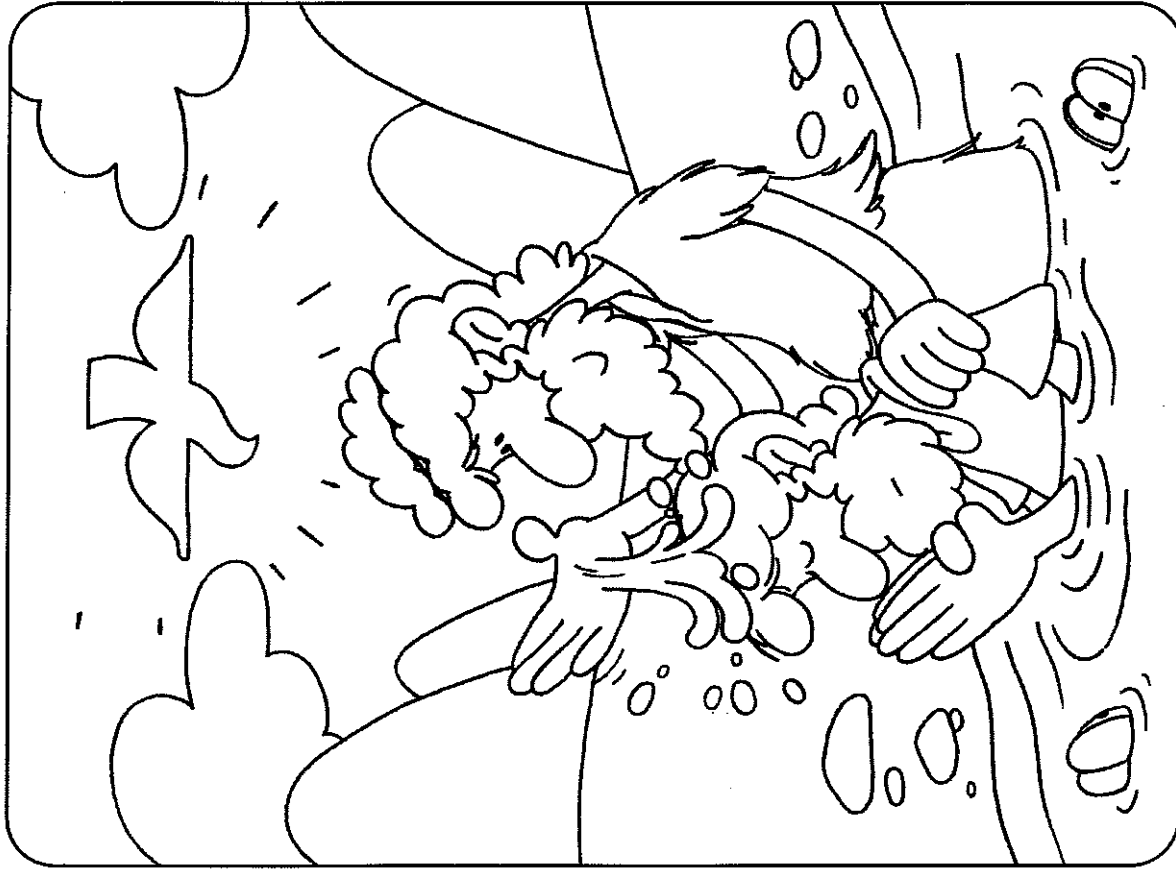
Jesus came from Nazareth of Galilee and was baptized by John in the Jordan. Mark 1:9