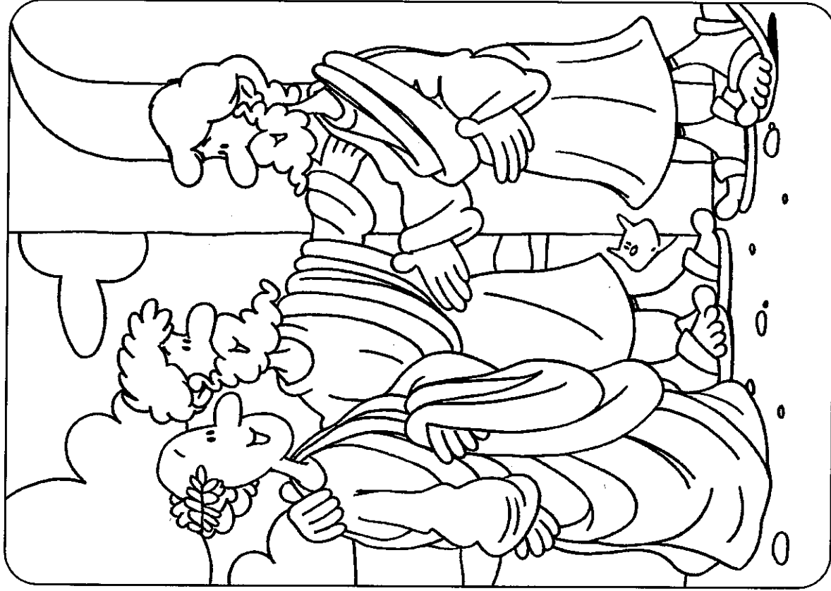
We wish to see Jesus.